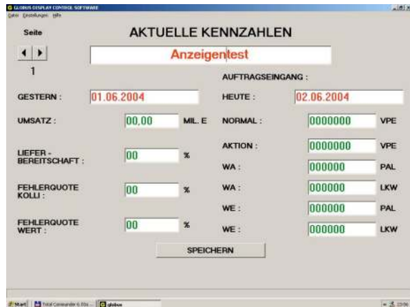
PC entry mask